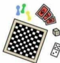
Playing board games