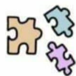
Doing a puzzle