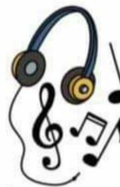
Listening to music