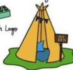
Making a den