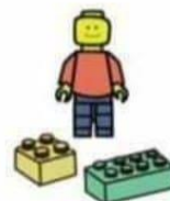
Building with Lego