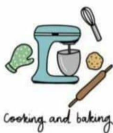
Cooking and baking