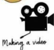
Making a video